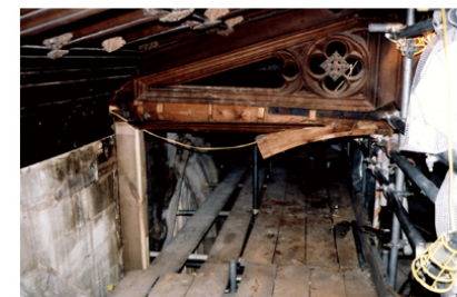
Holy Trinity Church, Stratford upon Avon - Truss repairs following dry rot attack.