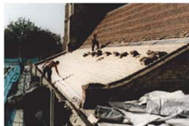
St Peters Church, Wellesbourne - Re-roofing works