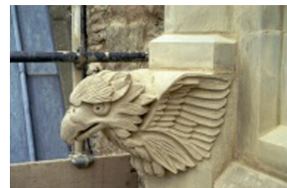
Holy Trinity Church, Stratford upon Avon - Replacement Grotesque