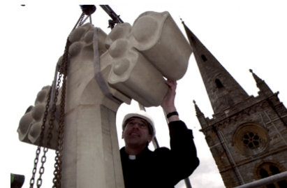
Holy Trinity Church, Stratford upon Avon - Replacement Cross